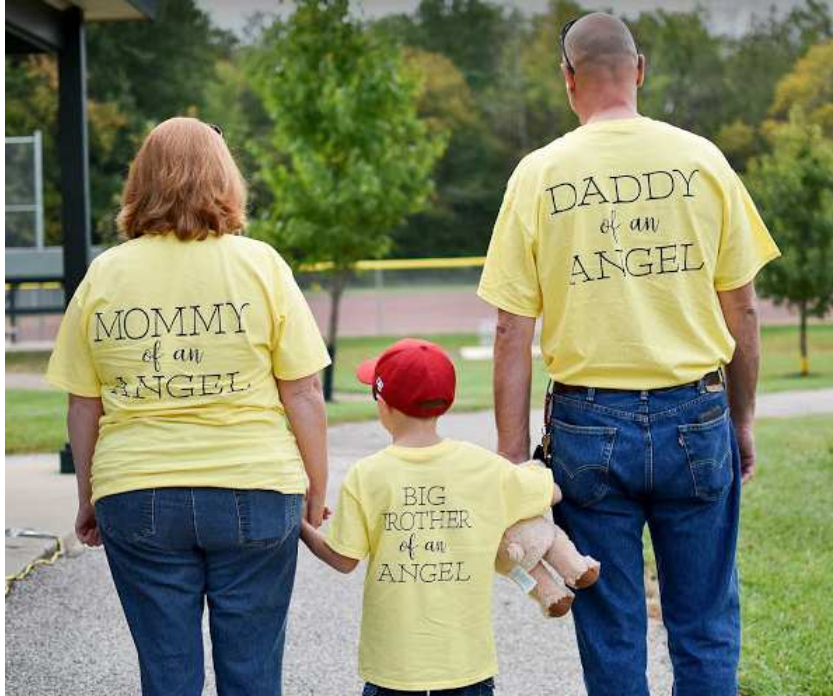
Families share their grief, and their joy.

Meanwhile, take a look at the photos from last year below.