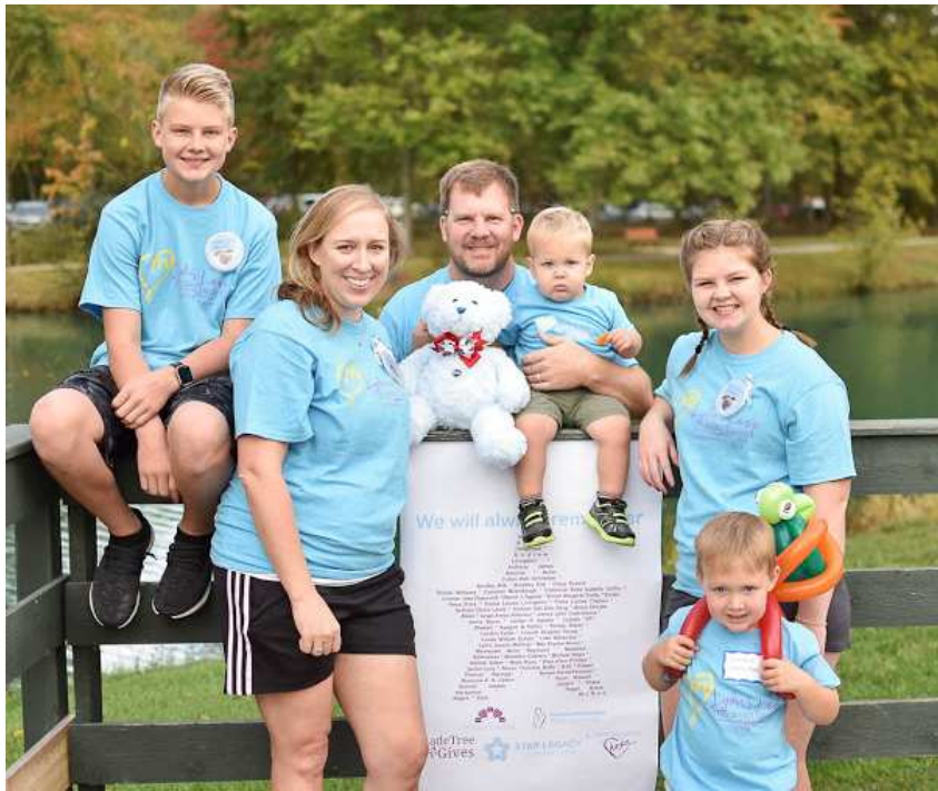
The star lists babies gone too soon. And families can pose with their names.