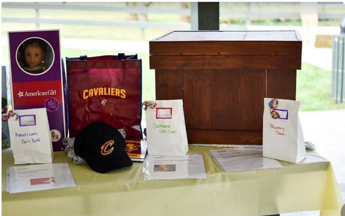
So many raffle prizes! And silent auction items! From sports gear to a full-year membership at the Columbus YMCA!