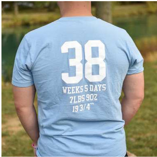
The families make their own T-shirts, honoring their babies.