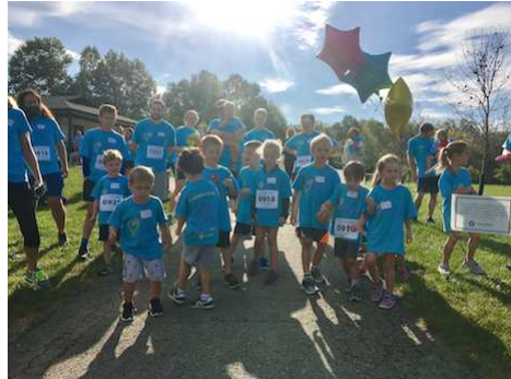
The kids dash at Lydie's Loop 2017.

The Ohio Chapter of the Star Legacy Foundation is prepping for its biggest fundraiser, Lydie's Loop: Steps against Stillbirth, in September.