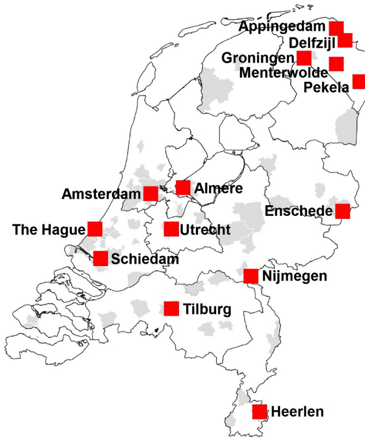
Figure 3 Participating municipalities in the 'Healthy Pregnancy 4 All' project.

services. Organisation and logistics regarding out roll of the two sub studies is presented in the specific design papers.