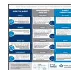
Safer Pregnancy 6x5 Magnet